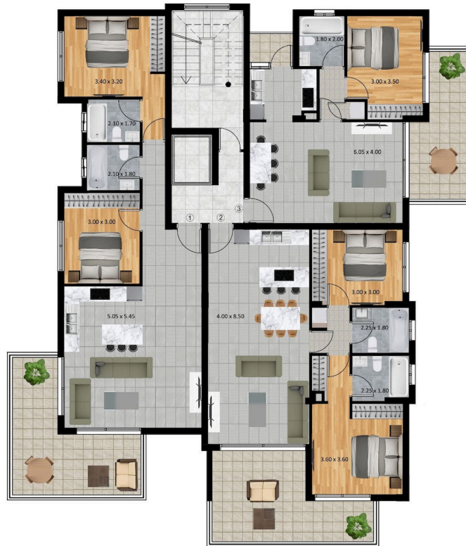
1ST, 2ND, 3RD, 4TH + 5TH FLOOR PLAN