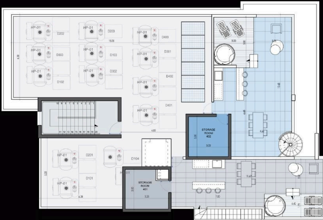
ROOF GARDEN APARTMENTS 401 48.47 m 2