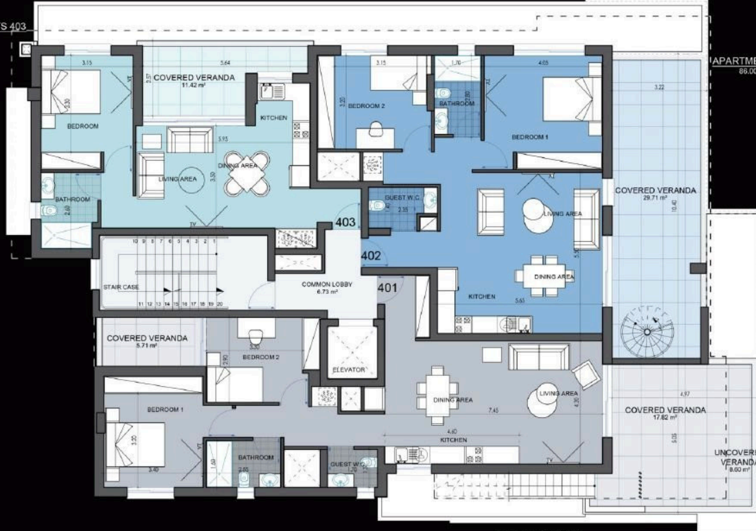
APARTMENTS 402 66.00 m 2