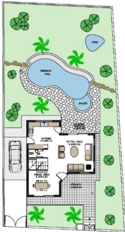
GROUND FLOOR HOUSE TYPE D