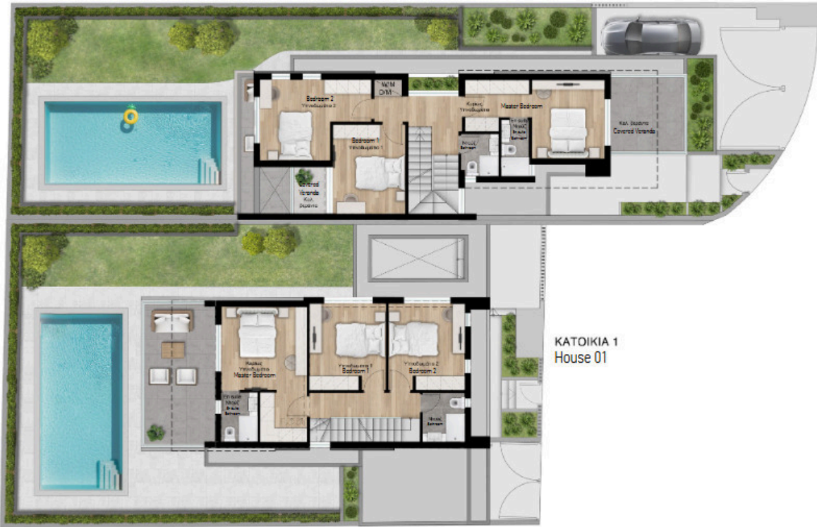
FIRST FLOOR FLOOR PLAN