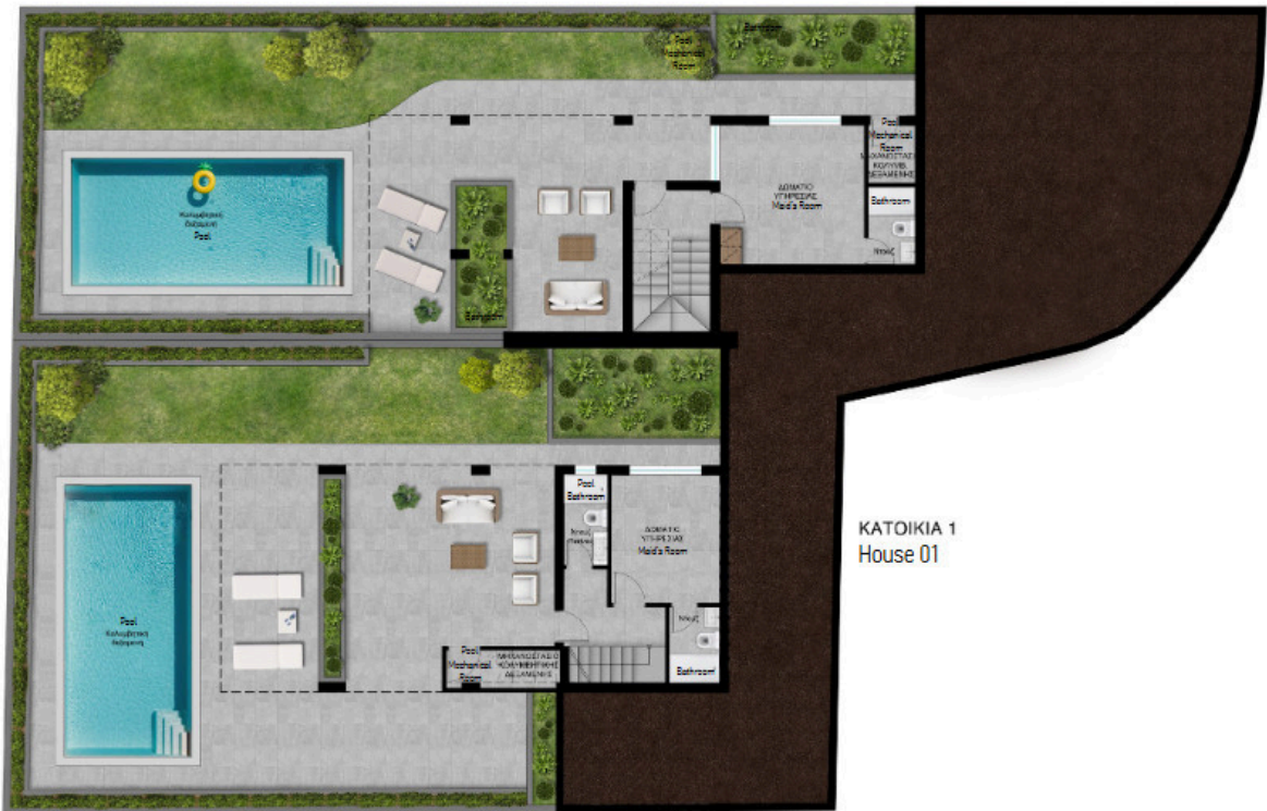
ΚΑΤΩΦΗ ΥΠΟΓΕΙΟΥ BASEMENT FLOOR PLAN